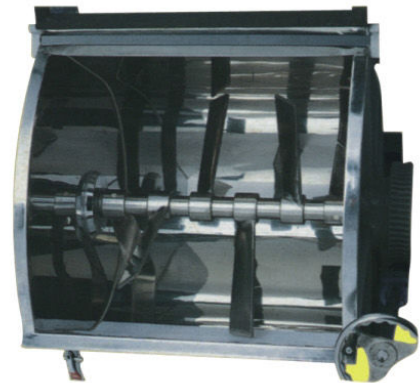
卧式桨叶 HORIZONTAL PADDLE